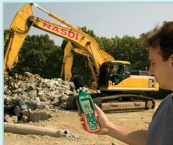
Meets new IEC 61672-1 Class 2 accuracy standard for OSHA and other local and national noise ordinances