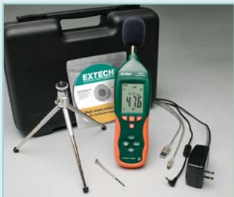
Meter and accessories are packaged in a rugged hard carrying case for added protection